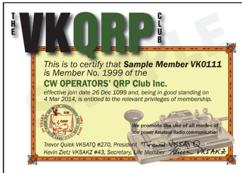
Club membership certificate (sample illustrated) 5" x 7" (127 x 178 mm)

Check our website www.vkqrpclub.org for latest information