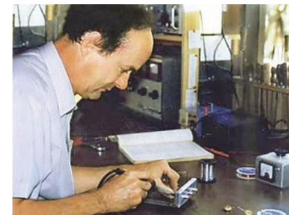
From the cover of AR